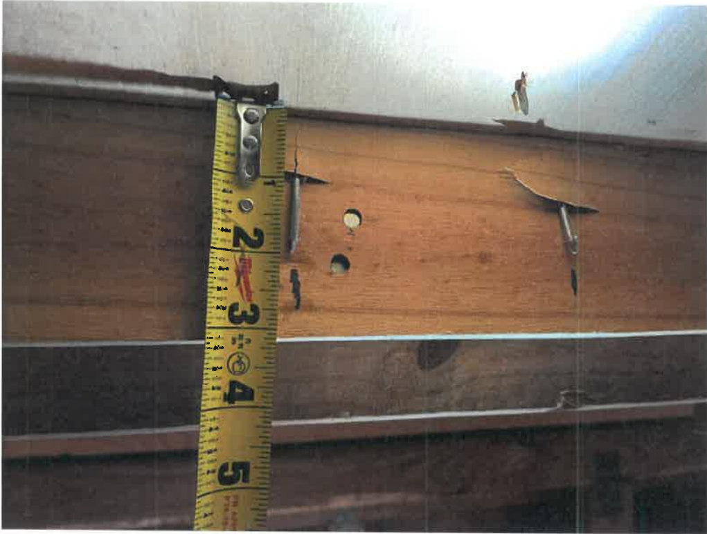
Figure 3 – Sheathing Fastener Size 8d Confirmed (Typical)