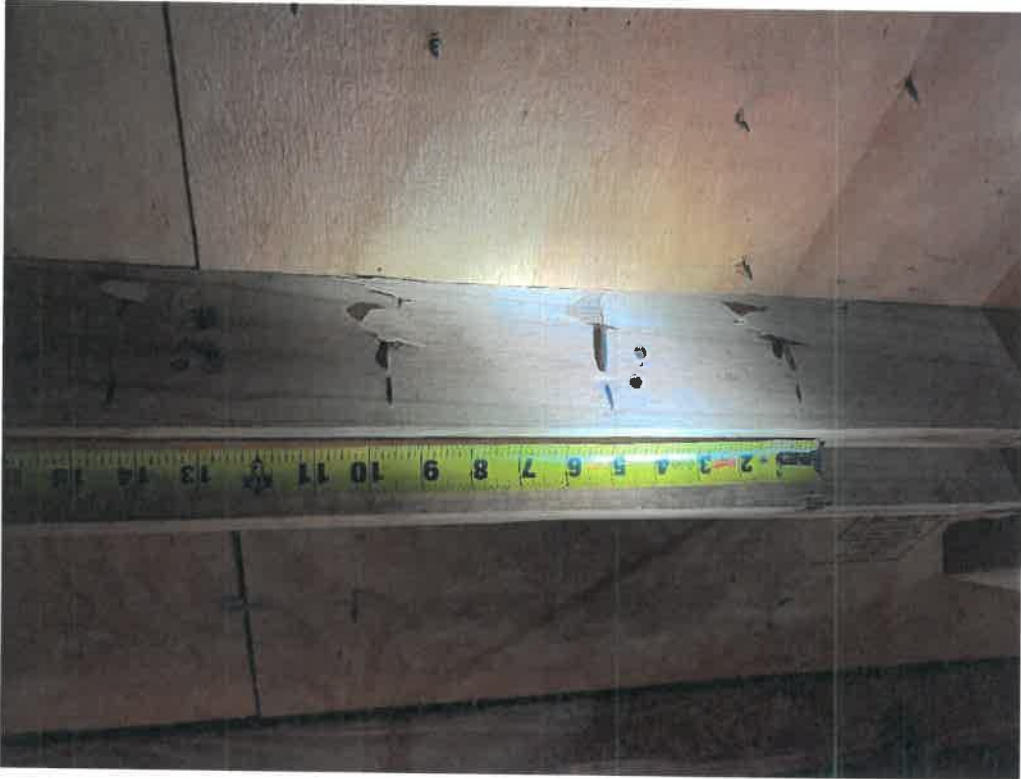
Figure 2 – Plywood Sheathing Nail Spacing (Typical)